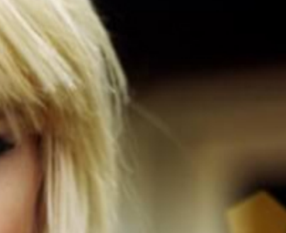
Premiere of February - not boring life, Jolly people